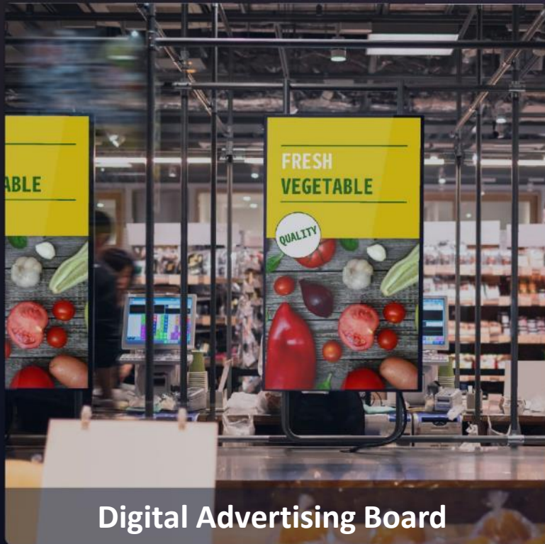
Digital Advertising Board

Amaze customers in your store with captivating visual content. Flytech's KPC6 digital signage player enables you to enhance customer engagement with attention-grabbing images and stimulate extra purchases that boosts cross-selling and upselling.