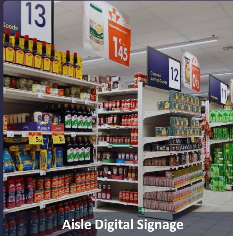
Aisle Digital Signage